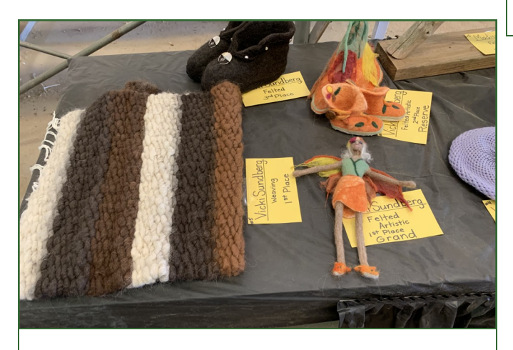
Finished Products Display — Adult