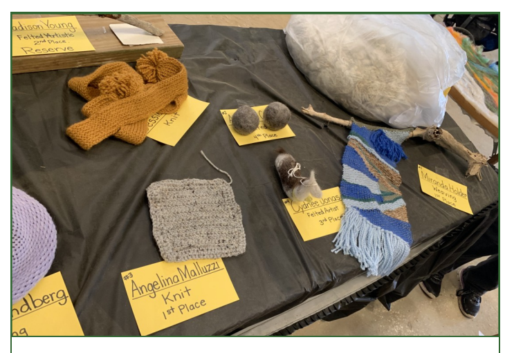
Finished Products Display — Youth